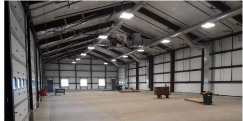
Photo above shows the interior of the New Solid Waste Building.

The next few days: This is the FINAL UPDATE on this