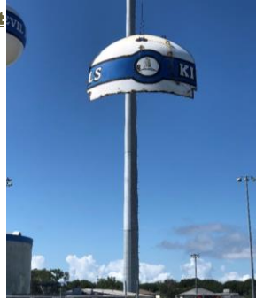
In Photos above and right, one of the logo panels of the old, 200,000 gallon elevated water tank, built in 1963, is lowered to the ground. All steel sections were cut up and trucked to a recycling company.

The next few days: Third pump/motor waiting on electrical component, expected around February; then electricians wire up and complete other minor items. Until then, normal operations continue with the original 2 pumps.