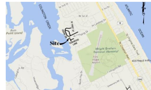
Photo above shows roads included in project.

The next few days: No activity for a month or so; first pipelaying will be in Spring Project.