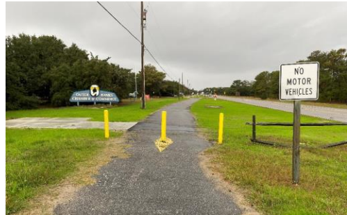
Photo above: Proper watering and nice Fall rains have resulted in good germination of hydroseeded areas along Colington Road.

The next few days: This is the FINAL UPDATE on this project