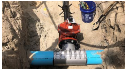
Photo above, Near the western end of the project, a stainless steel tapping sleeve and special tapping valve are used to tie a branch line into the existing 8" water main. This allows a connection without having to take the existing main out of service. A hole is drilled in the side wall of the pipe (black object, top-center, with 4 handles).

The next few days: Official pressure tests are done. After passing pressure tests, mains will be disinfected and filled, then bacteriological sampling and testing occurs. After clean bacteriological tests, NC DEQ Public Water Supply approves placing lines in service. Tie-ins and service pipe cutovers come right after that.