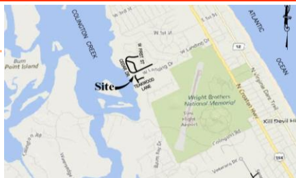
Photo above shows roads included in project.

The next few days: Documents completed, out to bid in next 2-3 weeks.