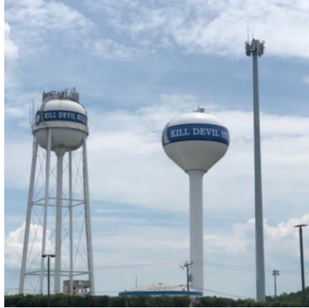
Photo at right shows (left to right): (1) the old (1963) 200,000 gallon water tank, (2) the new 400,000 gallon tank and (3) the new monopole cell tower.

New KDH-owned 180' monopole cell tower, being built under separate contract, is complete. AT&T and Verizon are operational on new monopole Tank demolition set for next Tuesday and Wednesday, September 1-2.